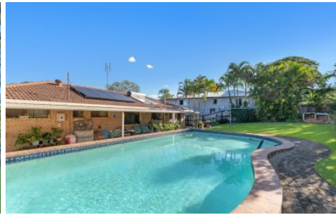
72 Collins Crescent Benowa QLD

Auction Location: Gold Coast Arts Centre, Bundall.