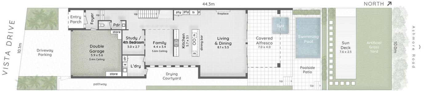
:: FLOOR & SITE PLAN Ground Floor - 2.7m Ceiling